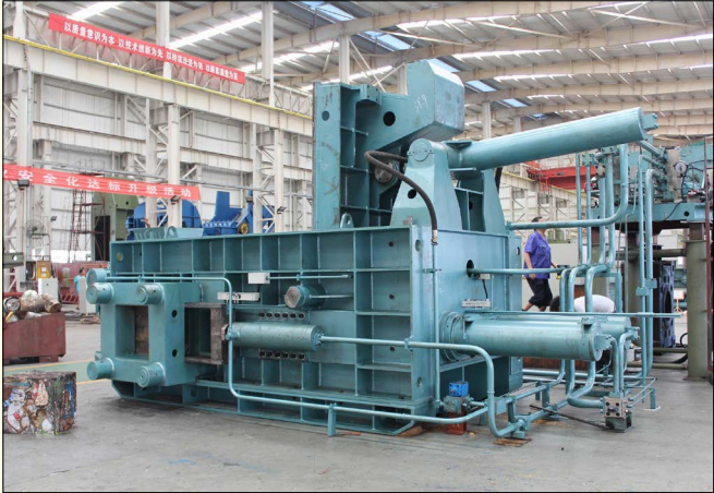
Metal Processing Plant