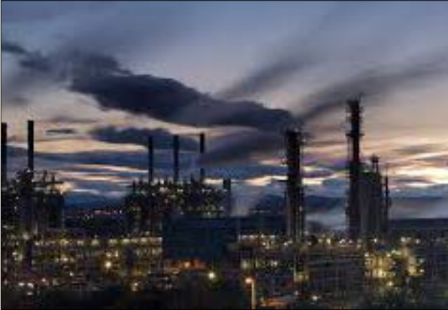
Gas & Leakage Monitoring Systems