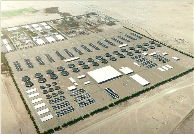
Sewerage Treatment Plant