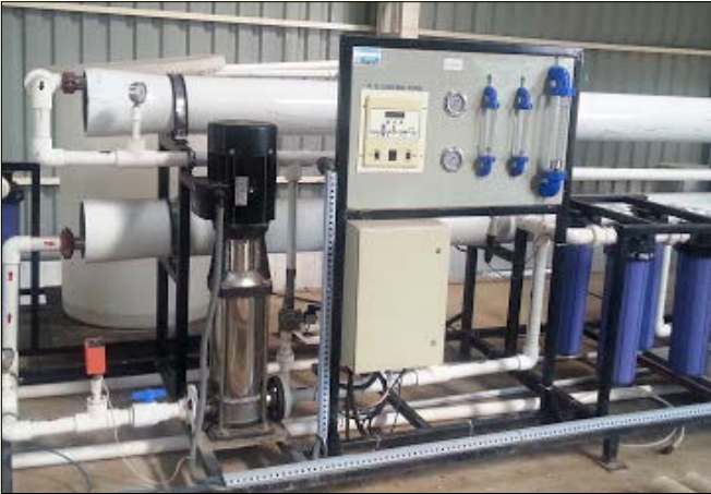
Reverse Osmosis Plants