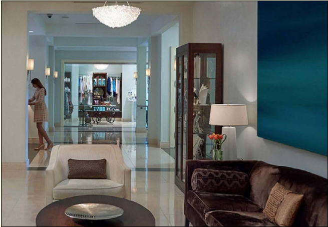
Schools & Hospitals