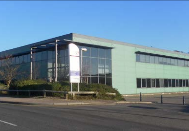
Commercial & Industrial Buildings