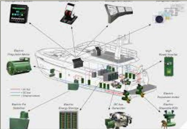
Energy Management System