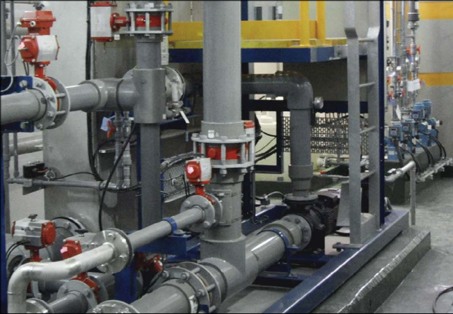
Water Pumping Networks