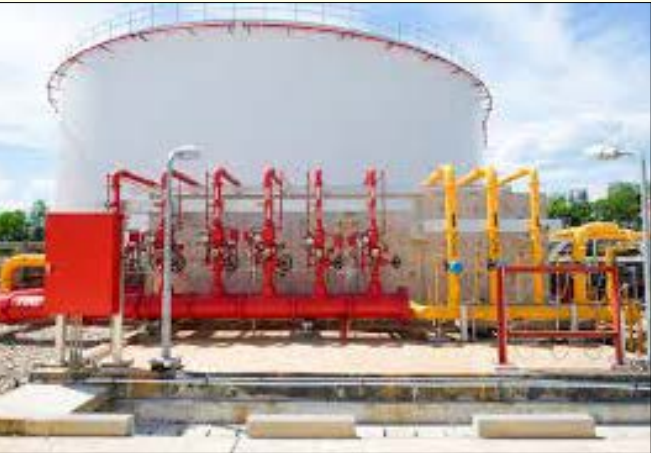
Fuel Tank Farm Monitoring Systems